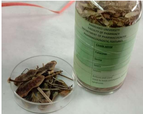
A: Cassia senna (Senna)