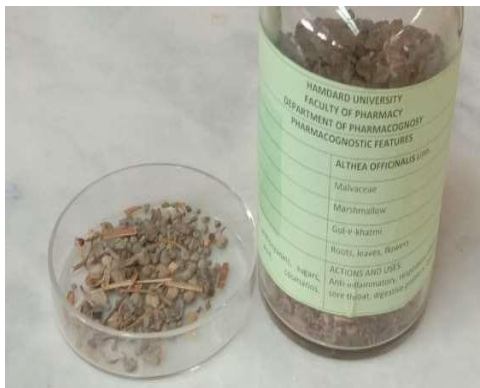
C: Althea officinalis L.