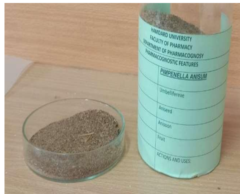
D: Pimpinella anisum