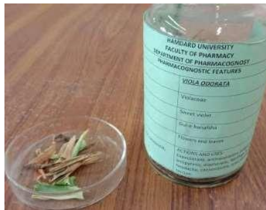
E: Viola Odorata